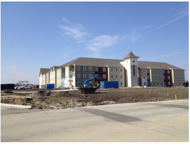
Phase I of Prairie Place is currently under construction with occupancy plans for Fall 2014.

A Developer Discussion Panel was held in University Park on March 21, 2014 and this report summarizes the discussion and the panel's recommendations and suggested strategies.