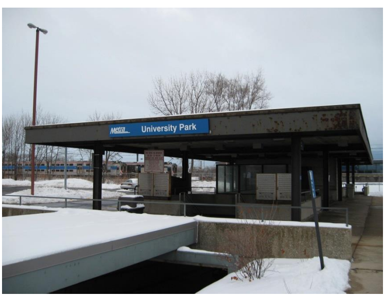
University Park Metra Station.

As part of these increased efforts, the RTA is working with the Urban Land Institute (ULI) in Chicago to facilitate discussions between individual communities and development experts to shed light on the future of TODs and how this relates to the changing market and economy.