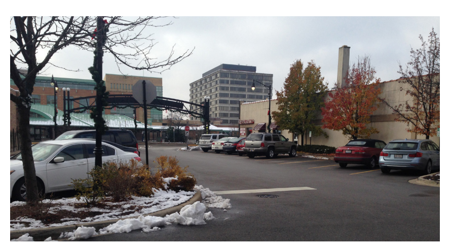
Parking spots along Metropolitan Way