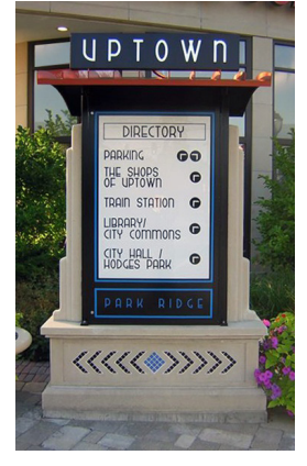
U D T O W N P A R K R I D C E