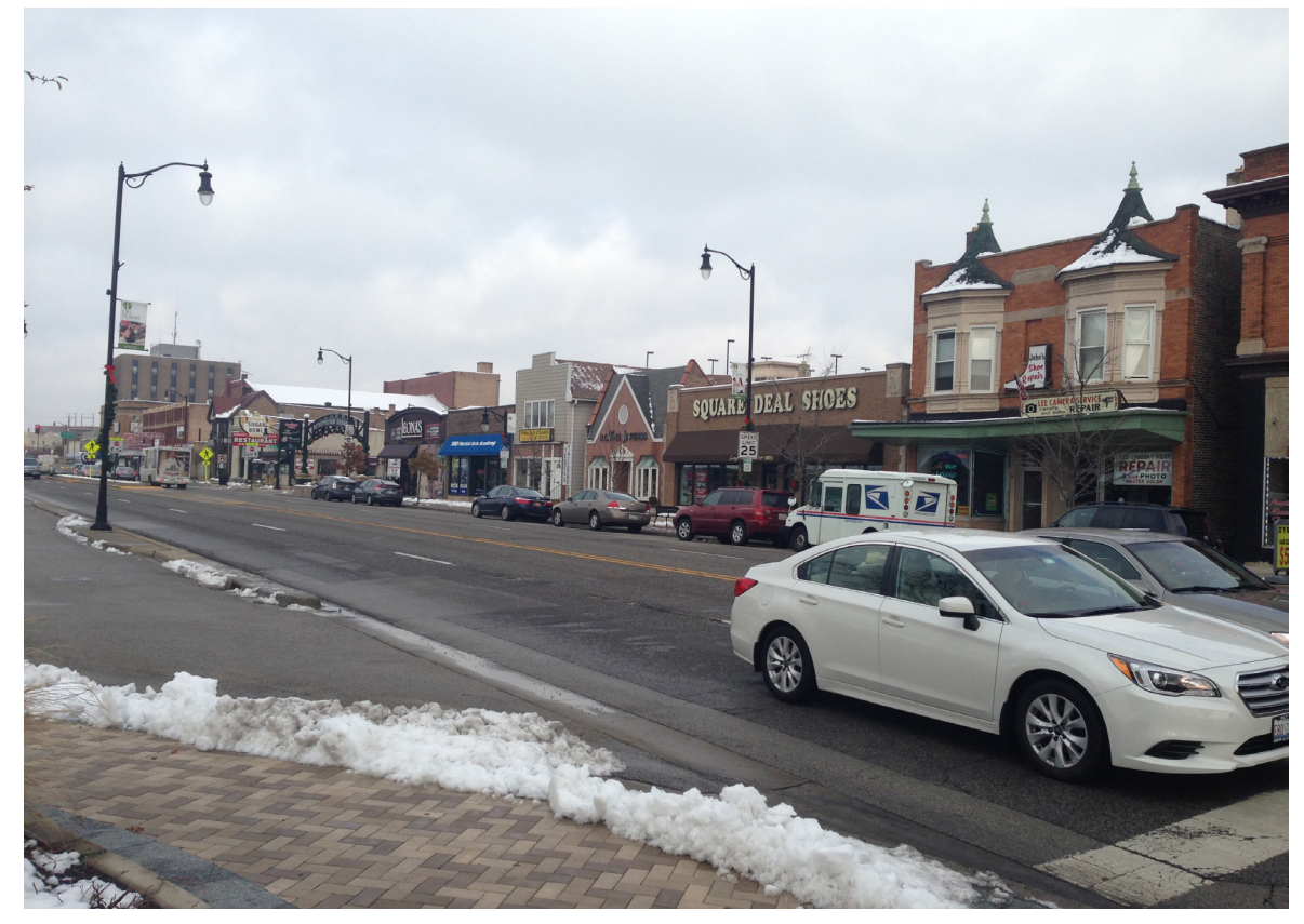
Miner Street in downtown Des Plaines

The participants of the discussion panel also had focused comments for the broader downtown area. They ranged from direct actions for specific lots to general considerations for the downtown as a whole. The following section will summarize those suggestions.