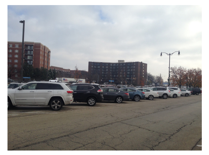
Commuter parking along the Metra tracks