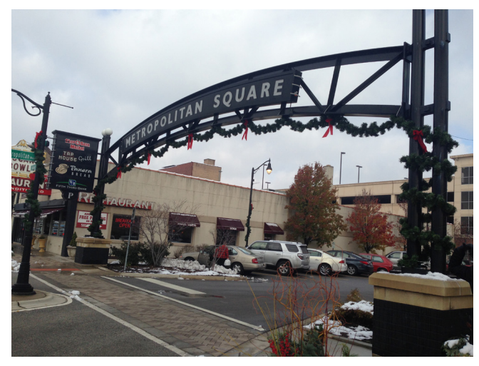
Entrance to Metropolitan Square

Metropolitan Square is a mixed use development in downtown Des Plaines that opened in 2006. Described as a "minilifestyle center," the square is anchored by a 40,000 square foot grocery store and includes a series of structures that are comprised of 135 residential units, around 22,000 square feet of office space, an additional 56,000 square feet of retail space, and a public parking garage<sup>4</sup>. Despite all of its features, the square has faced a number of issues over the years. These include commercial vacancies and a lack of vibrancy. The panelists made the following recommendations to help reinvigorate the space.