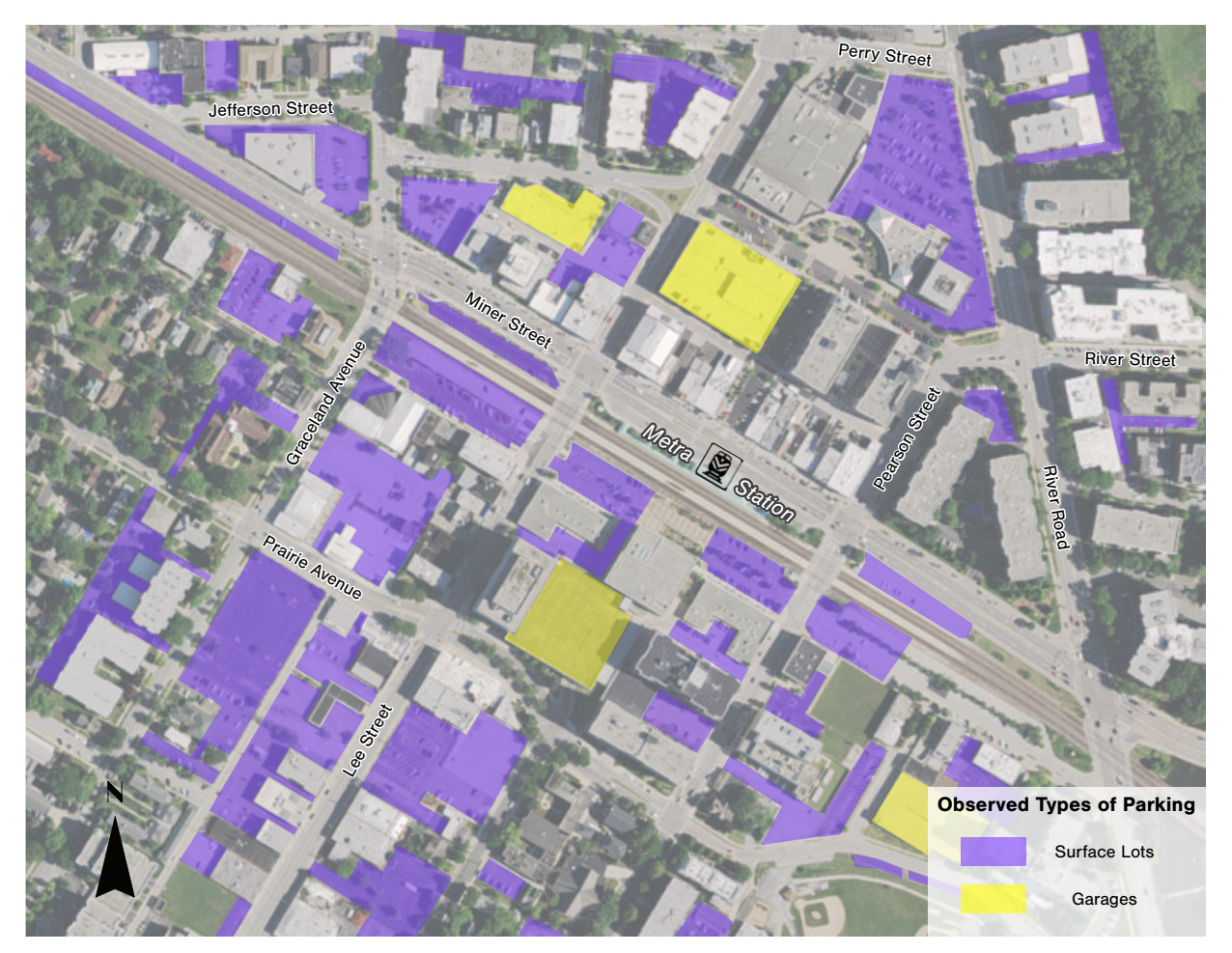
Parking that was observed on the tour of dowtown Des Plaines

There are differing perceptions on the availability of parking in the downtown area. Some locals believe the area has a shortage of spaces to accommodate its workers, residents, and visitors. Others think more than enough parking exists in the downtown area and that the real issue lies with the management of the existing spaces. Overall, there is a prevalent uncertainty on the status of downtown parking. The panelists acknowledged this and made the subsequent suggestions.