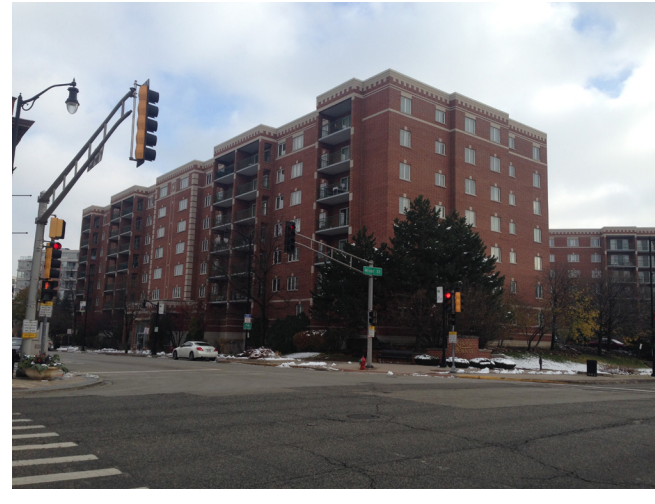
Existing TOD housing