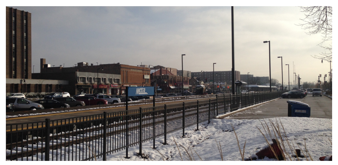
Metra tracks in downtown Des Plaines

Downtown Des Plaines is the community's most prominent center of activity. Visitors and residents can find shops, restaurants, and offices all in walking distance to the Metra station. Even though the area has so much to offer there are still a lot of opportunities to strengthen it. The participants of the discussion panel recognized this and devised these recommendations to assist in shaping the downtown area for the years to come.