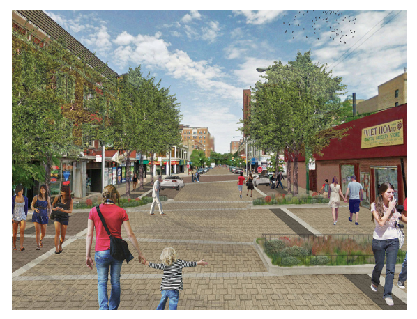
Rendering of the shared street concept on Chicago's Argyle Street<sup>7</sup>