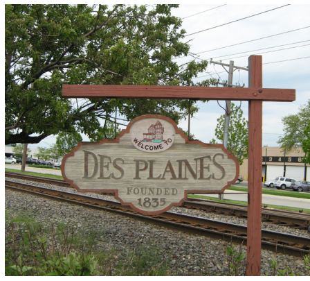
Welcome sign in Des Plaines9

Des Plaines is a northwestern suburb of Chicago. The city is located 17 miles from the Loop, encompasses 15 square miles of area, and is home to just over 58,000 people<sup>1</sup>. Des Plaines is primarily a residential community, but there are a few centers of mixed use activity within in its boundaries.