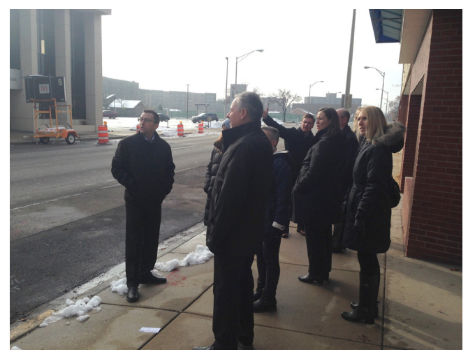
A tour of downtown