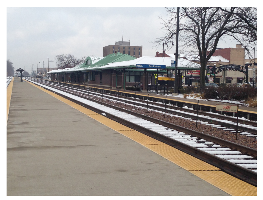
Metra station in downtown Des Plaines

From the RTA's perspective, pursuing and achieving implementation of these plans can result in more efficient transit operations, improved access to transit services, and the potential to increase ridership on the transit systems of the agency's three Service Boards (Metra, Pace, and CTA). Implementation efforts can also increase private investment in TOD areas while promoting the principles of sustainability and livability.