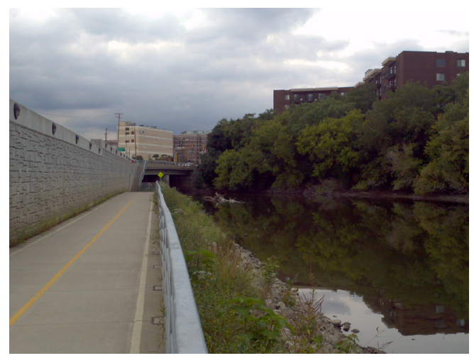
The Des Plaines River Trail during the summer months<sup>3</sup>

Downtown Des Plaines is home to numerous amenities. These include restaurants, offices, municipal institutions, retail outlets, and local landmarks. There are also several natural resources, like the Des Plaines River and Northwestern Woods, that are nearby. The participants of the discussion panel provided feedback to better connect these amenities.