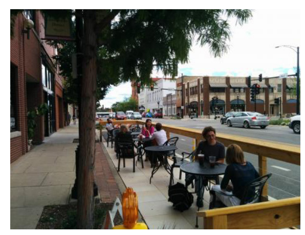
Example of a parklet in Urbana, IL<sup>2</sup>