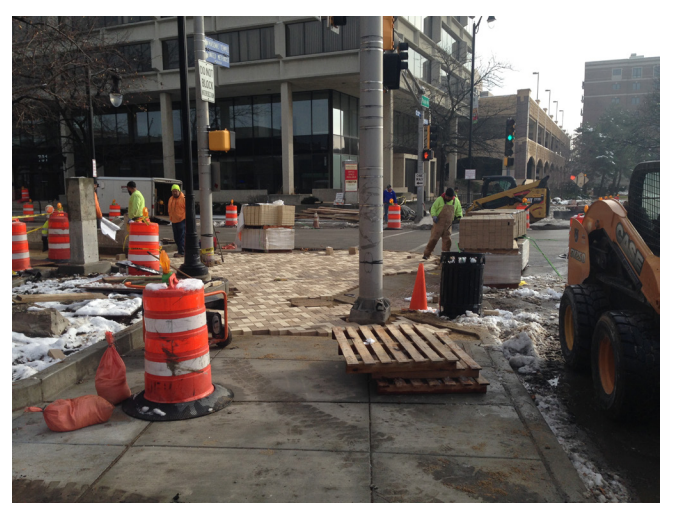
Streetscape enhancements in downtown