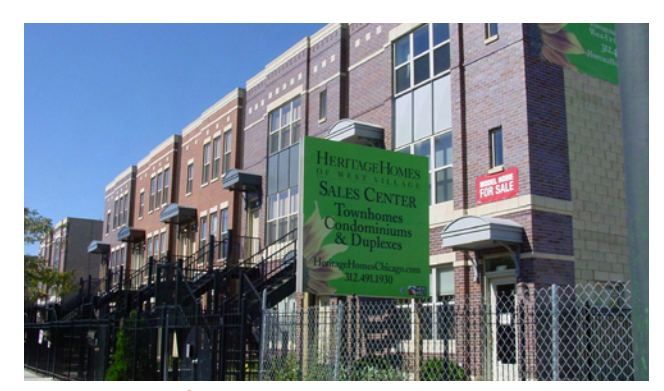
New homes for sale on Madison Street.