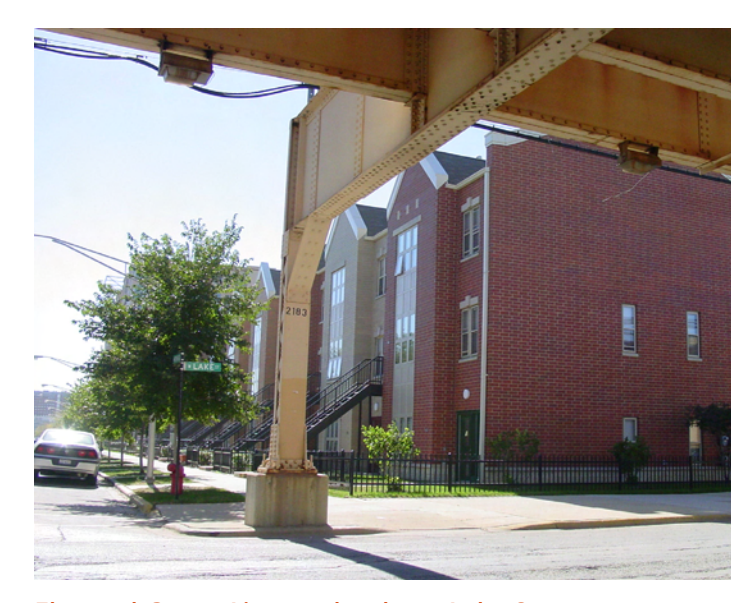
Elevated Green Line tracks above Lake Street

station could provide an opportunity for the United Center to strengthen its connection to the Near West area, and reduce the current amount of parking required for games and events.