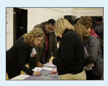
Near West Community Meeting