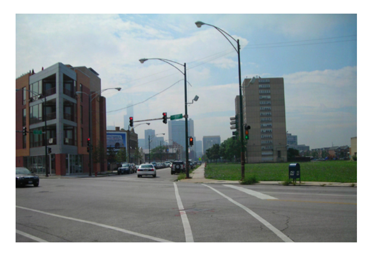
The vacant lots at the intersection of Clybourn and Larrabee contribute to a streetscape on Clybourn with little visual interest or pedestrian amenities.

Land use in the Near North Area is currently an eclectic mix of development types, organized on a street grid of long blocks separated by a series of major east-west arterial streets. The former CHA Cabrini-Green public housing complex is in the process of being removed, and in its place a new mixed-income community, the Parkside at Old Town, is under development. Additionally, several other privately financed residential and mixed use development projects demonstrate market strength on the Near North side. Though many new commercial and service uses have recently come online within the study area, community members have continually stressed the study area's lack of easy access to affordable retail and services. To this end,