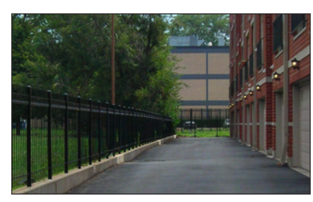
Impeded circulation in the Near North for pedestrians at the Riverfront pathway (top) and along Blackhawk Street (bottom).