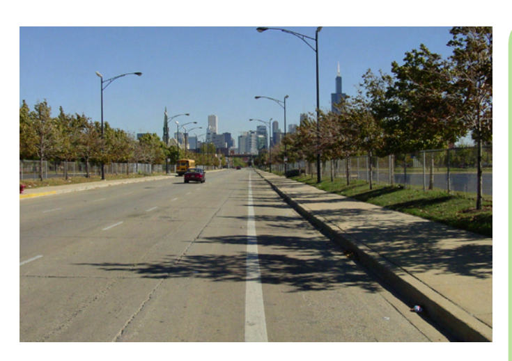
The United Center parking lots contribute to a streetscape on Madison with little visual interest or pedestrian activity.

Land use in the Near West study area includes a variety of use and development patterns, organized on a street grid of long blocks separated by a series of major east-