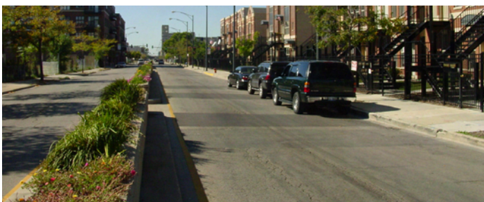
Activity centers and recent public realm investments in the study area provide a strong basis upon which to build new connections. Clockwise from top left: the United Center, Mabel Manning library, existing Madison Street median.

The Near West recommendations summarized in this report reflect input received from the IGAC, Task Forces, and the community at large. The Near West Study Area Recommendations map on the following page summarizes the Strategies identified through this planning process. A detailed description of each strategy is provided, followed by an Implementation discussion that includes a summary matrix of action items.