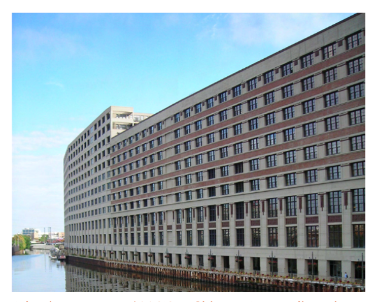
Adaptive re-use at 600 West Chicago Avenue lines the North Branch of the Chicago River.