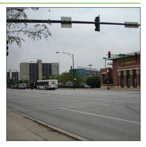
Existing pedestrian crossing conditions at the intersection of Division and Sedgwick (above) in the Near North area.

Implementation strategies for pedestrian crossing improvements include consistent design treatments along major roadways and at busy intersections that include safety elements. These elements include upgraded paving that clearly defines crosswalk areas, improved pavement markings, countdown signaling and, where feasible, providing corner "bumpouts" or median islands that reduce pedestrian crossing distance and increase available sidewalk area for street furniture, bicycle racks, or outdoor cafes.