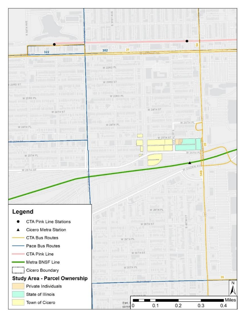
Map of Study Area.

The Cicero Connections plan proposed that this site would have a combination of three-story townhome units and a 4-8-story mixed-use building with ground floor retail and multi-family residential units. In the Town's Comprehensive Plan, however, this site's proposed land use did not include any residential use. Instead, the Comprehensive Plan proposed adaptive reuse of the former Town Hall building and preservation of the existing commercial buildings directly adjacent to the former Town Hall building. The Comprehensive Plan also proposed a two-story commercial infill building and a new 2-3-story commercial/industrial building. The map below shows the location and context of the study area in Cicero.