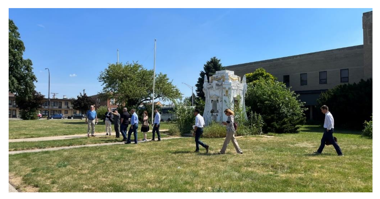
Developer Panel Discussion participants during site visit to Study Area, July 19, 2022

To attract prospective developers, the panelists believed that the Town could perform the due diligence and some of the initial site preparation work so that the site would be ready for construction. By conducting environmental and historical surveys of the opportunity site and identifying any existing environmental concerns or historically significant structures, the Town could help to reduce the delay involved in the sale process and more easily find a developer interested in the site. In addition, the panelists suggested that the Town could convey the land to developers at no cost, which would provide added incentives for commercial developers looking to invest. Furthermore, the panelists recommended listing the lots with a broker to help advertise the development opportunity.