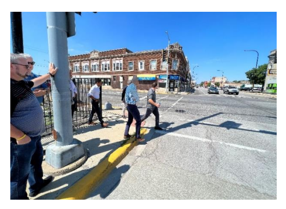
Left image: Developer Discussion Panel participants during site visit to Study Area, July 19, 2022 Right image: Developer Discussion Panel participants at intersection of Laramie Ave and 25<sup>th</sup> Street, looking west