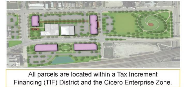
The main parcel, including the former Town Hall & Publics Works buildings, salt dome, & canopy is directly across from the Cicero Avenue Metra Station. It includes approximately 3.5 acres of developable land over 16 individual PINs and a vacated alleyway.