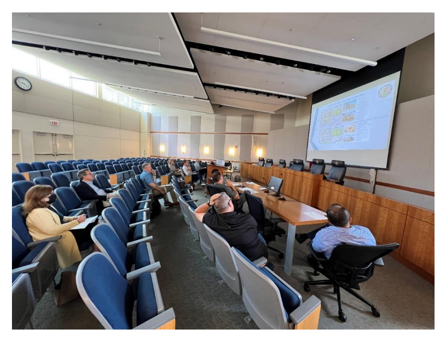
Developer Discussion Panel at the Cicero Town Hall, July 19, 2022